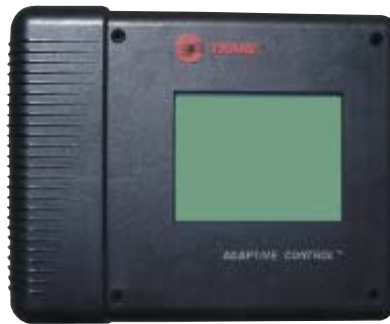
DynaView control user interface

You and your neighbourhood will appreciate the sound level.